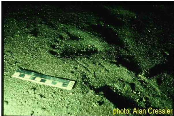
A (left) human footprint from more than 1km deep inside a cave - dated to more than 3,000 years ago.

The State of Tennessee boasts more recorded caves than any other state in the union, some 9000+. Most of these occur in the highland regions of East and Middle Tennessee, e. g., the Cumberland Plateau and the Ridge and Valley physiographic regions. In short, caves are part and parcel geologic features in the uplands of Southern Appalachia. Native Americans who lived in these regions for more than 12,000 years were keenly aware of this fact to the degree that we can say that caves were not only part of the natural landscape but also part of the cultural landscape. Therefore, archaeological studies of these regions that do not include caves are incomplete. So, while I confess to becoming interested in cave archaeology in part because of perceptions of mystery and difficulty, it is the fact that Native Americans in upland regions made use of their entire landscape, including caves, for a variety of purposes that has kept me exploring these dark environments. Caves were used for the extraction of resources, such as flint for stone tools, various minerals, shelter, habitation, and sometimes for the production of art. Evidence for this same range of activities is also found on archaeological sites in the open air outside of caves. The point is, again, that caves in Southern Appalachia were an integral part of the natural and cultural landscape.